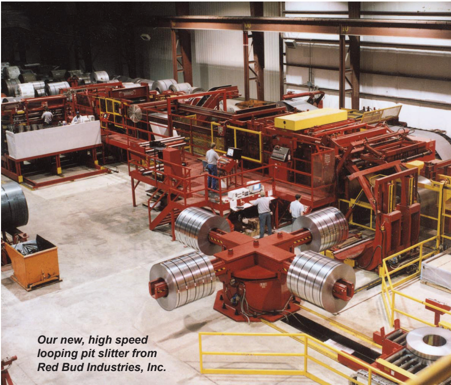
Our new, high speed looping pit slitter from Red Bud Industries, Inc.